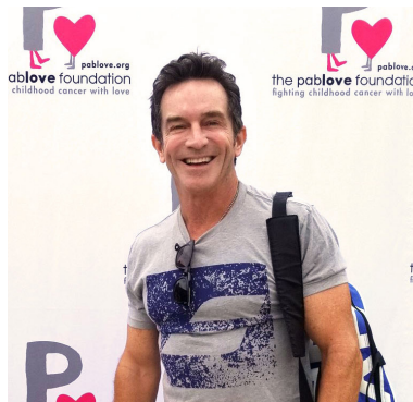
Television personality + Survivor host, Jeff Probst