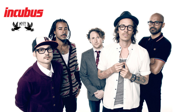
Pablove Tennis Title Sponsor, Incubus